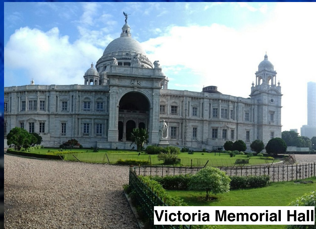
Victoria Memorial Hall