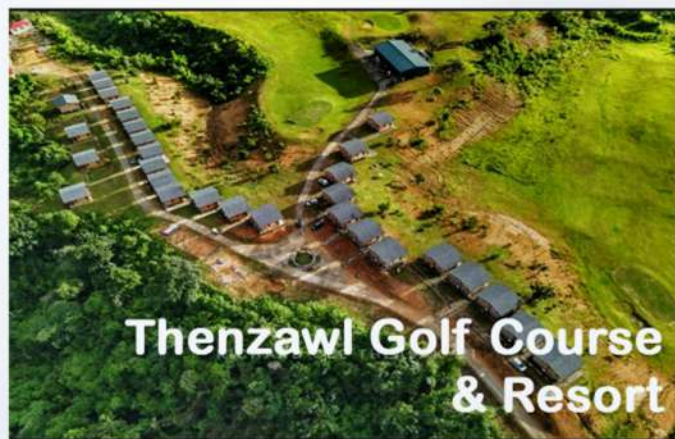
Thenzawl Golf Course & Resort